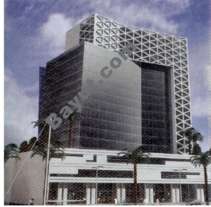
Haz Tower Exterior View