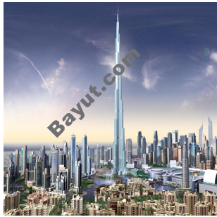
Burj Dubai Exterior4