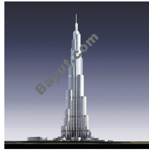
Burj Dubai Exterior5