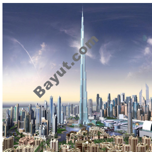
Burj Dubai Exterior4