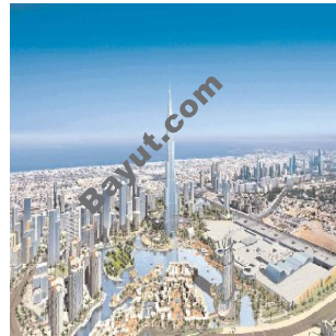
Burj Dubai Exterior3