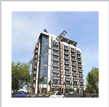
Oasis High Park 1 Exterior View 1