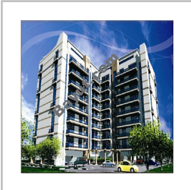
Oasis High Park 1 Exterior View 2