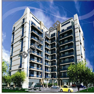
Oasis High Park 1 Exterior View 2