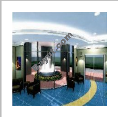
Oasis High Park 1 Lobby