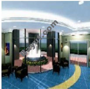
Oasis High Park 1 Lobby