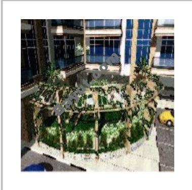
Oasis High Park 1 Barbeque Area

For larger view click link below http://www.bayut.com/uae_dubai_floors/oasis_high_park_1_full_residential_floor_for_sale_in_dubai_silicon_oasis-365056.html