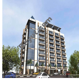
Oasis High Park 1 Exterior View 1