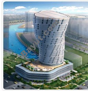
Iris Crystal Exterior 2