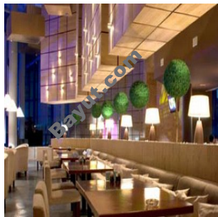
Iris Crystal Business Center