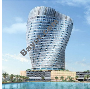
Iris Crystal Exterior