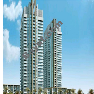
Exterior view 2