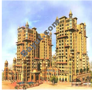
Fortune Serene Exterior View