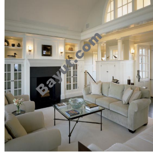
Red Residence Interior View