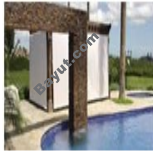
Red Residence Swimming Pool