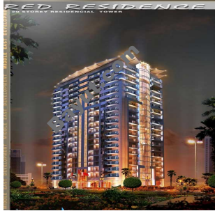
Red Residence Exterior View