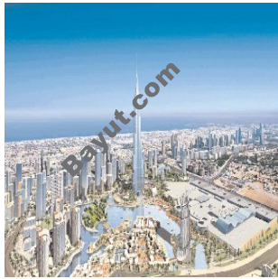
Burj Dubai Exterior3