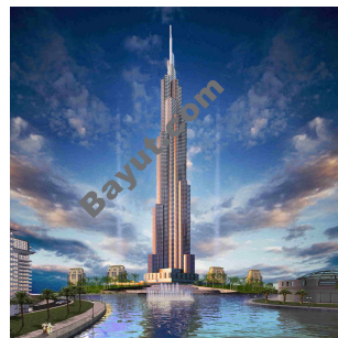
Burj Dubai Exterior6