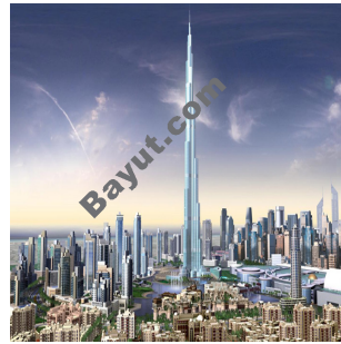
Burj Dubai Exterior4