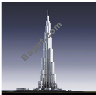
Burj Dubai Exterior5