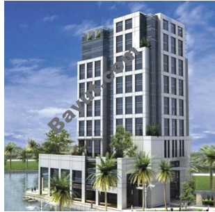
Park Central Exterior View