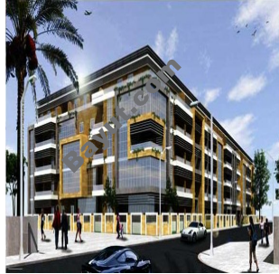
Muhra 2 Exterior View