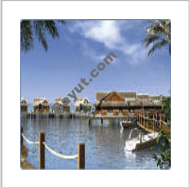
Water Homes Exterior View 3

For larger view click link below http://www.bayut.com/uae_dubai_townhouses/water_homes_luxury_4_bedroom_townhouse_for_sale-358950.html