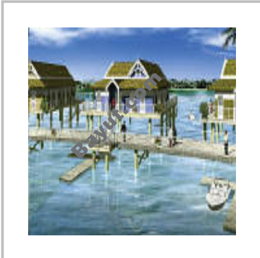
Water Homes Exterior View 2