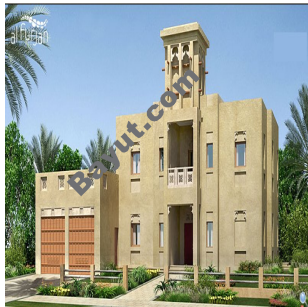
Al Furjan 3