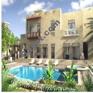
Al Furjan 1