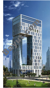
Exterior View 1