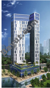
Exterior View 2