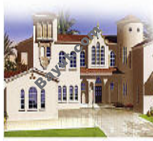
Signature Villas Exterior View 2