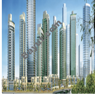
Boulevard Crescents Exterior