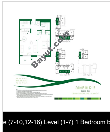
e (7-10,12-16) Level (1-7) 1 Bedroom b