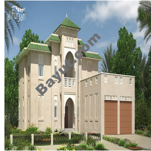
Al Furjan Quortaj