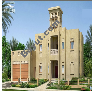
Al Furjan Dubai