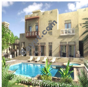
Al Furjan Al Hejaz