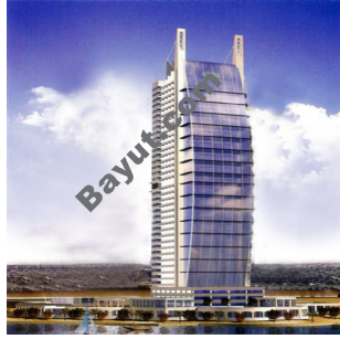
Armada Tower 2 Exterior View