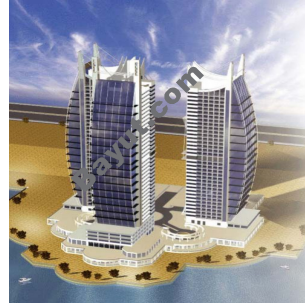
Armada Tower 2 Exterior View2