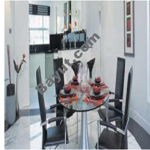
Terra Del Sol 1 and 2 Dining