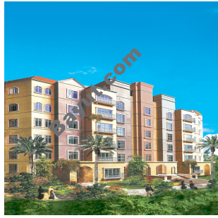
Del Sol 1 and 2 Exterior View