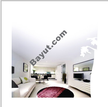
The Residences Interior View