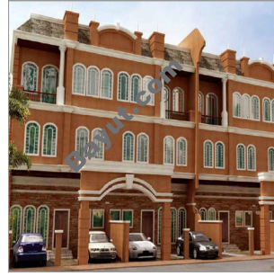
Ajman Villas Exterior View