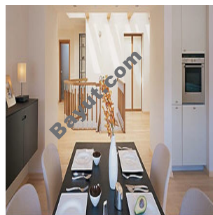
Ajman Villas Dining