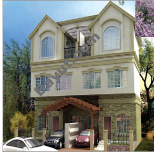
Ajman Villas Exterior View 2