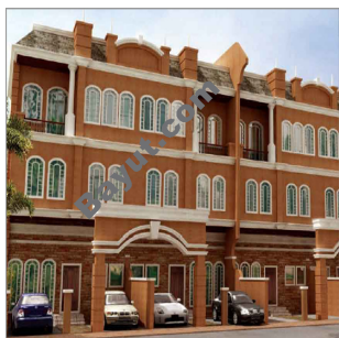
Ajman Villas Exterior View