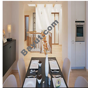
Ajman Villas Dining