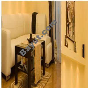
Ajman Villas Drawing Room