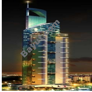
I & M Tower Exterior View