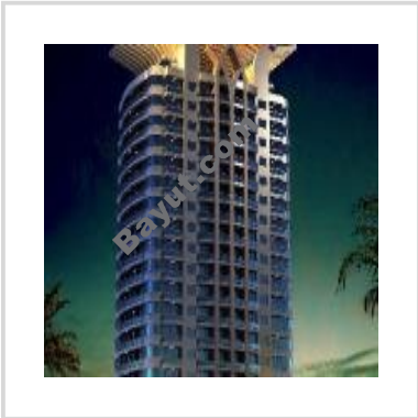
Champions Tower IV Exterior View 2