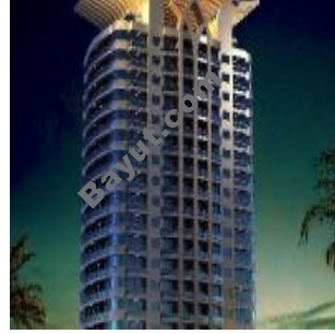
Champions Tower IV Exterior View 2