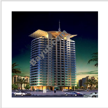
Champions Tower IV Exterior View