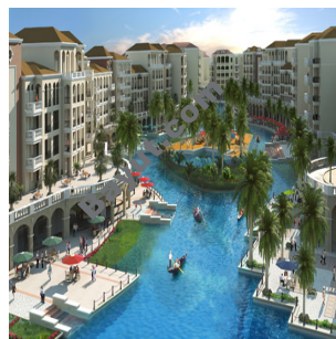
Wadi Walk Exterior View 2