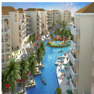
Wadi Walk Exterior View 1