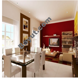
Wadi Walk interior View