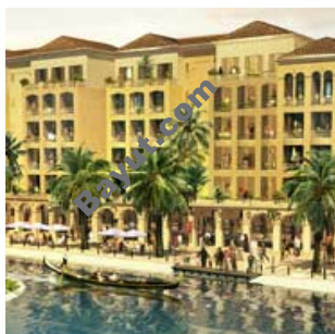
Wadi Walk Apartments Exterior View 3