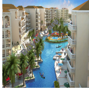
Wadi Walk Exterior View 1