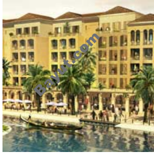
Wadi Walk Apartments Exterior View 3