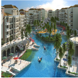
Wadi Walk Exterior View 2