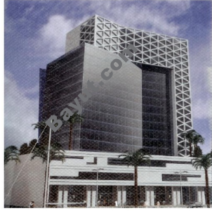
Haz Tower Exterior View