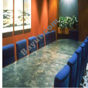
Haz Tower Meeting Room