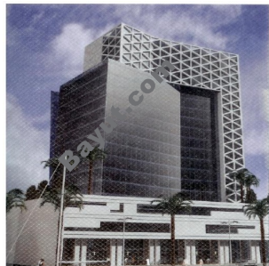
Haz Tower Exterior View