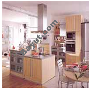
Shoreline Apartments Kitchen