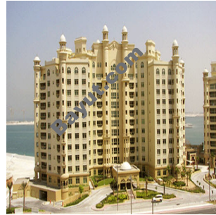
Shoreline Apartments Exterior View