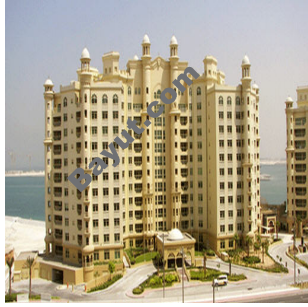
Shoreline Apartments Exterior View