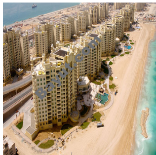
Shoreline Apartments Exterior View 1