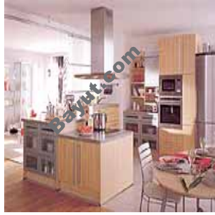
Shoreline Apartments Kitchen