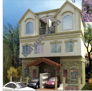
Ajman Villas Exterior View 2