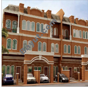
Ajman Villas Exterior View