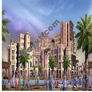
Al Ameera Village