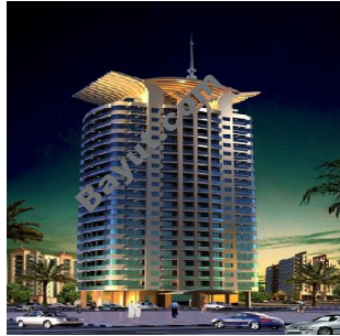
Champions Tower IV Exterior View