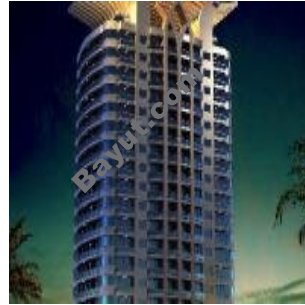
Champions Tower IV Exterior View 2